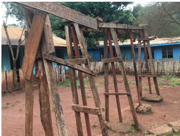
Existing Swing Set

Shining Star started in January 1999 as a nursery school in a rented room within Tambaya trading center measuring 12*10 feet. The enrollment started with 6 students and rose to 24 by the end of the year.