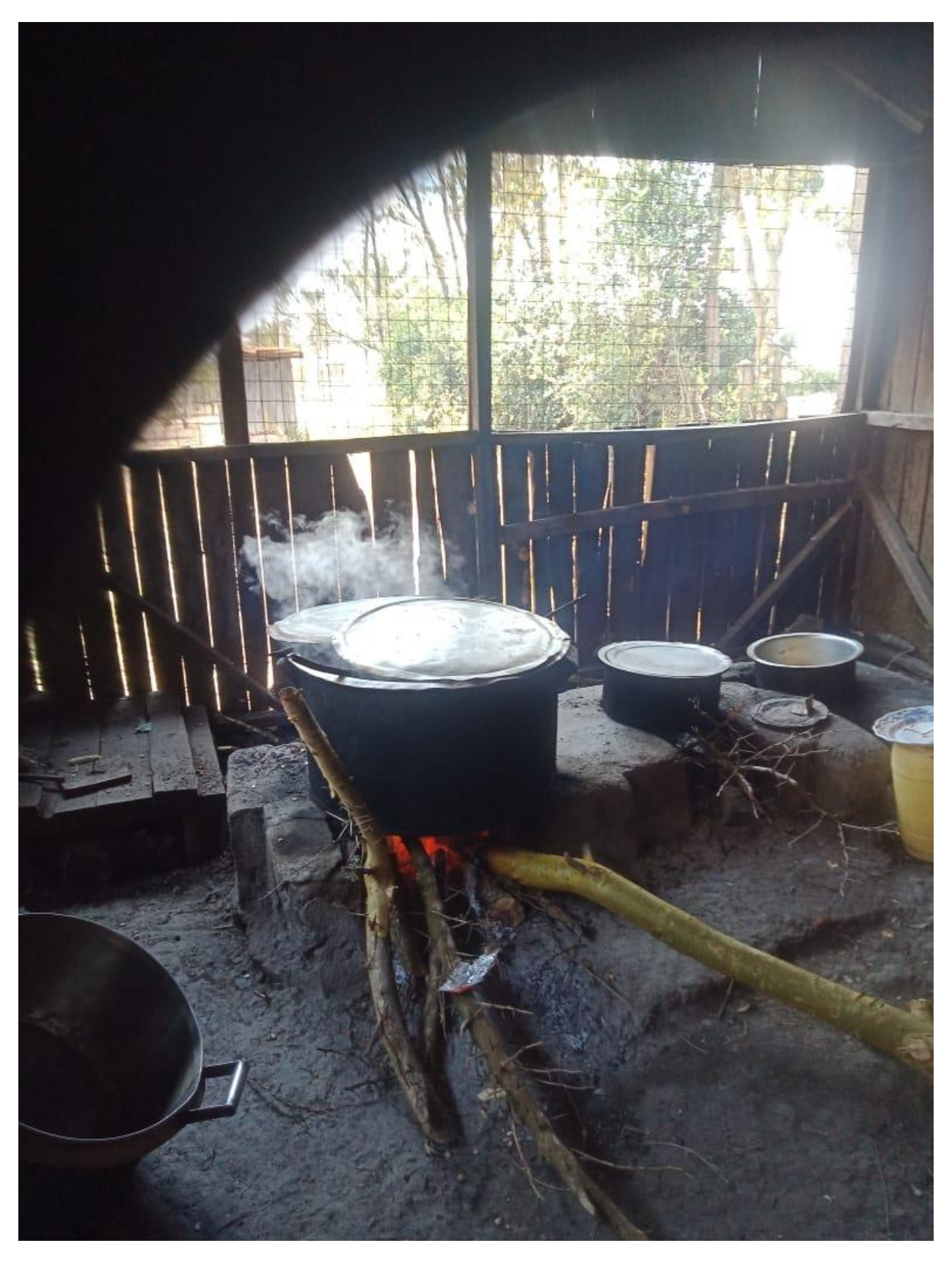
MEAL PREPARATION AS WE DO IT AT THE MOMENT.