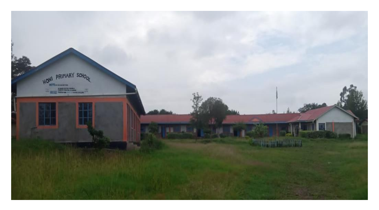
CURRENT STATUS OF CLASSROOMS IN THE SCHOOL