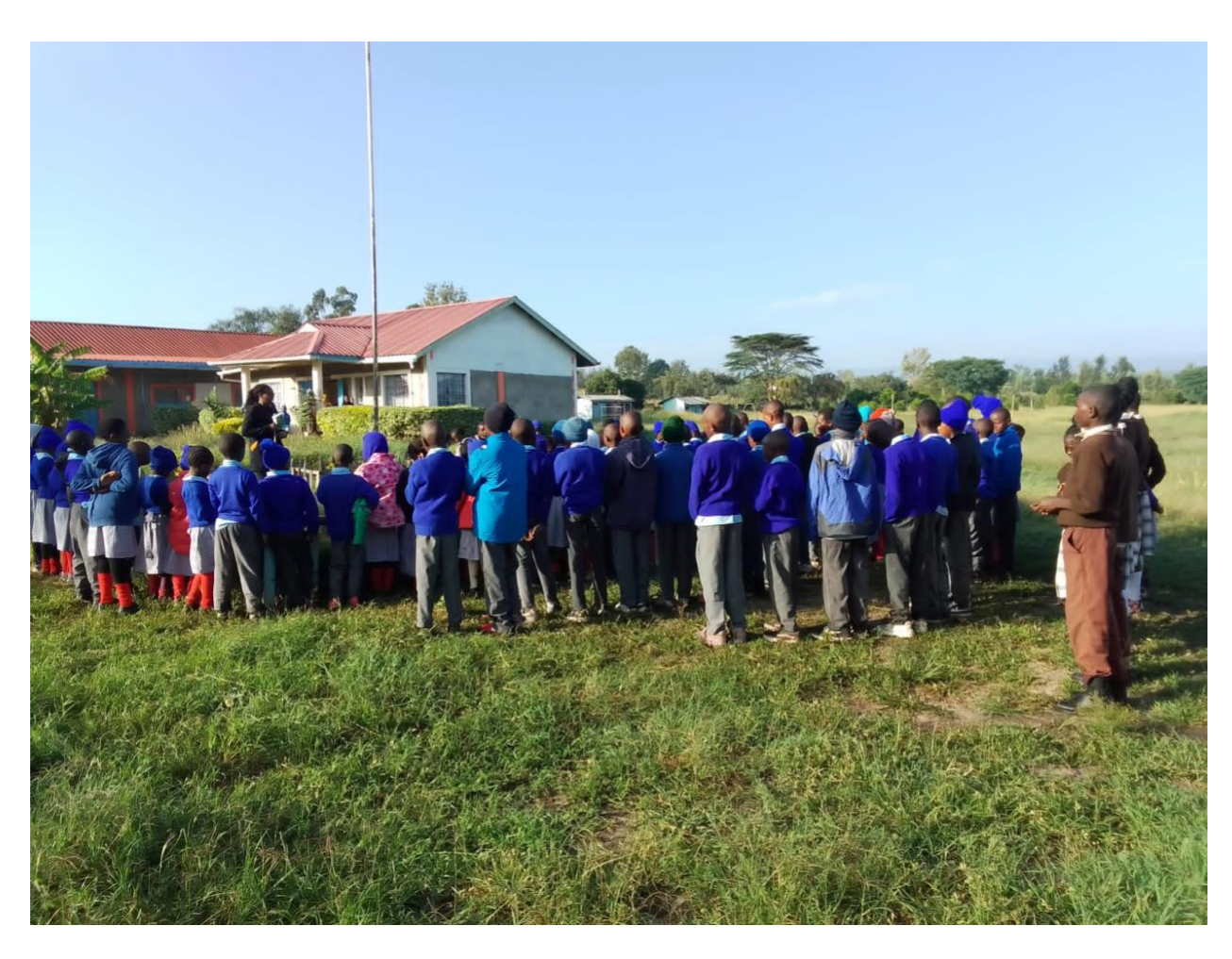
LEARNERS DURING A MORNING ASSEMBLY