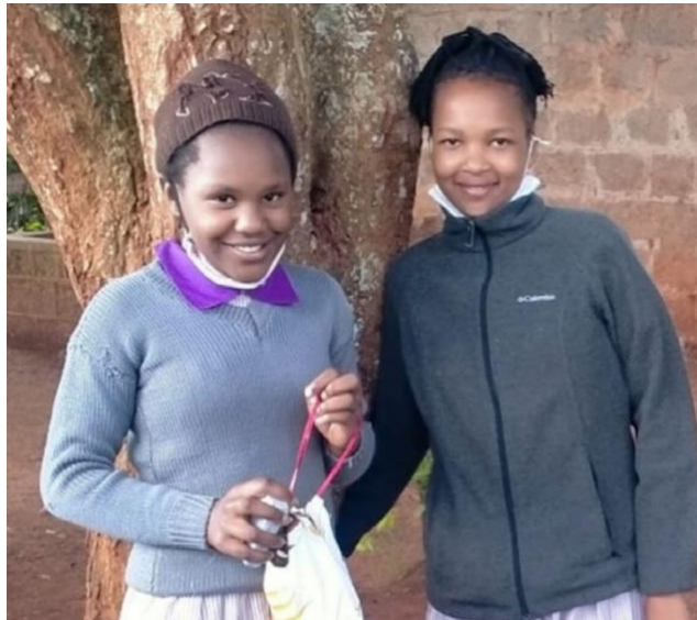
Kenyan girls receive Save a Girl kits

To do that, we build small-scale infrastructure projects in developing-world countries: classrooms, medical clinics, latrines, water wells, science labs, playgrounds, kitchens, and more. Local recipients are required to contribute at least 20% of the cost of a project. This is usually done through in-kind work.