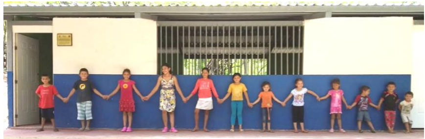
A new classroom in Nicaragua

TGUP's mission is to Uplift humanity—to increase its capacity for self-development by empowering people to help themselves. It's working.