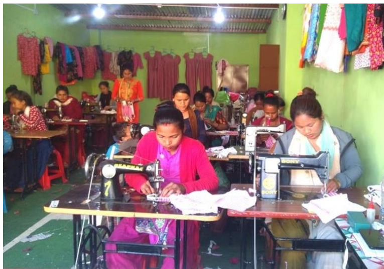
TGUP's Save a Girl sewing center in Nepal