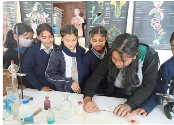
Nepal students use TGUP's SLaB

In 2021, TGUP began installation of its Science Lab in a Box. SLaB provides the equipment and curriculum to allow developing world high school students to carry out world-class laboratory work in Biology, Chemistry, and Physics. Without hands-on lab experience, students cannot apply to the best universities.