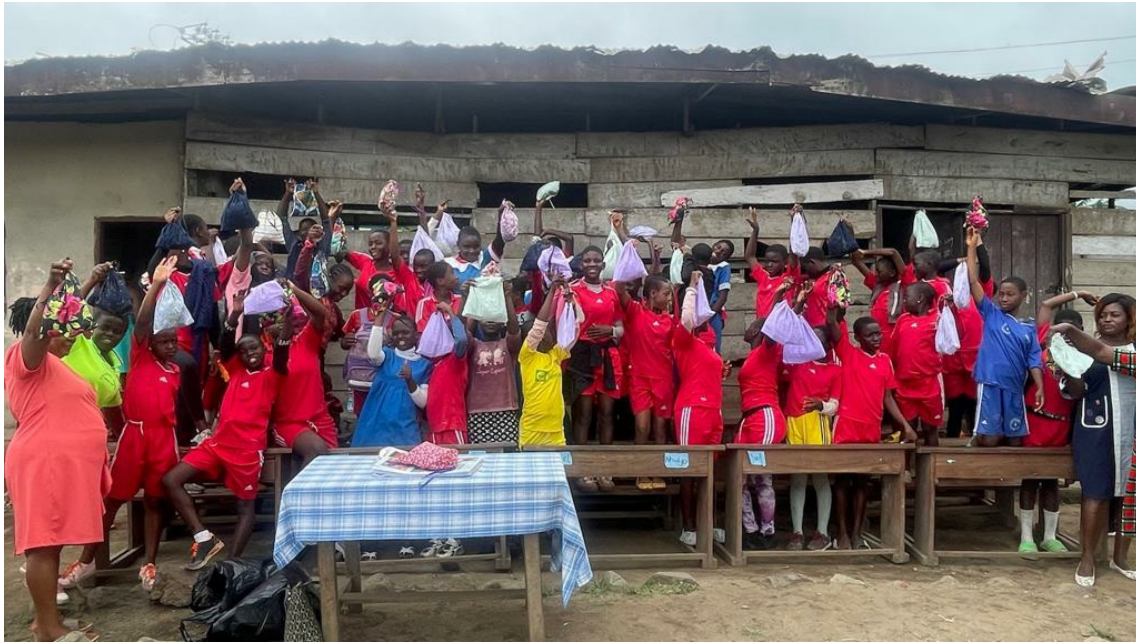
Cameroon girls receiving TGUP's Save a Girl ™ kits We will soon renovate this decrepit classroom behind them, too

So, clearly, this is working. But, what is the thought behind what we're doing? Why is it working? The answer is embodied in this visual, where everything is localized around education: