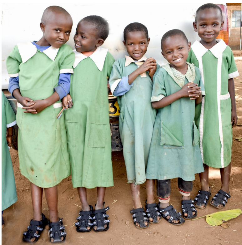
Kenyan girls with their new 'Shoes that Grow' from TGUP The shoes expand through five successive sizes

In this issue, we explain the strategy behind what we do. First, however, we look at the fact that it's working as well as it is. And then, why it's working.