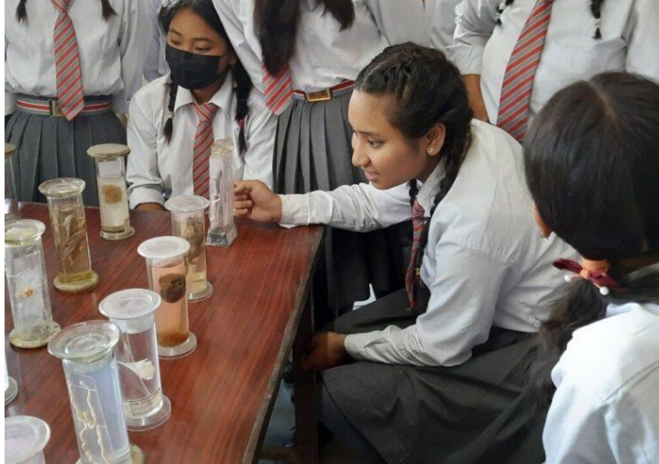
Nepal students use TGUP's Science Lab in a Box™

In 2023, the distribution of our projects, framed by the Educational Diamond, was: